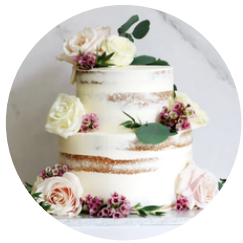
STYLE #2: THE AMBERLY from £210 to serve 60