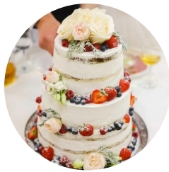
STYLE #4: THE TARA from £255 to serve 60