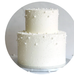
STYLE #7: THE SABINA from £265 to serve 60