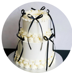
STYLE #12: THE ISABELLE from £245 to serve 60