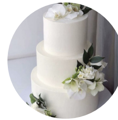
STYLE #6: THE CLEO from £218 to serve 60