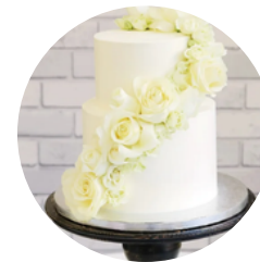
STYLE #12: THE SYLVIA from £255 to serve 60