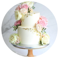
STYLE #9: THE CLARA from £235 to serve 60