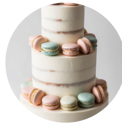
STYLE #5: THE BELLA from £240 to serve 60