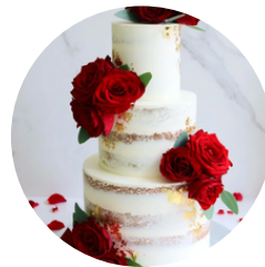
STYLE #12: THE AUDREY from £225 to serve 60